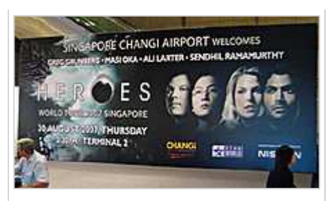
Meet and Greet Event for Heroes World Tour, Singapore Changi Airport, Singapore.

television industry as an effective marketing device. <sup>[96]</sup> In 2006, NBC also created a Heroes parody entitled Zeroes . Zeroes , which was released as a viral video on sites including YouTube, features parodies including four chapters and an open audition. Development and production of the project was kept secret from Tim Kring. <sup>[97]</sup> NBC hosted panels at the 2006, 2007, 2008, and 2009 Comic-Cons in San Diego to promote the series. Major announcements have been made during the panel, along with sneak peeks of forthcoming seasons. In 2006, the Heroes panel presented the entire season one 72-minute pilot. In 2008 the first half of the season three premiere was shown. Comic-Con also allows the