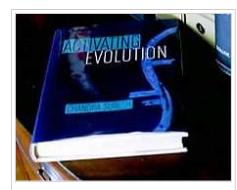
Activating Evolution, a fictional book featured in the series